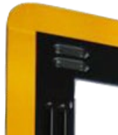
Reflective tape, with louvers