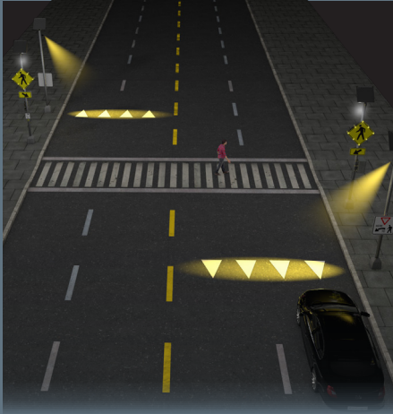
AMBER LIGHT - YIELD MARKINGS