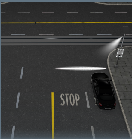
WHITE LIGHT - RAIL CROSSING