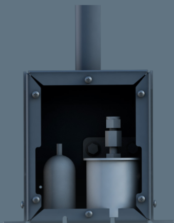
DOG LEG ASSEMBLY WITH FLOAT AND PRESSURE SENSORS