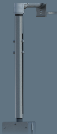
DOG LEG ASSEMBLY SENSOR