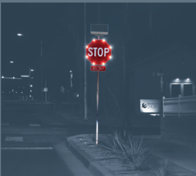
PERPENDICULAR OR OFFSET ANGLE