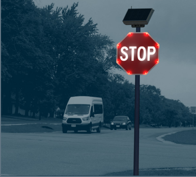
LOW AMBIENT LIGHT CONDITIONS