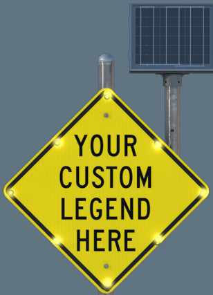
13W SOLAR TUBE 14AH BATTERY CAPACITY