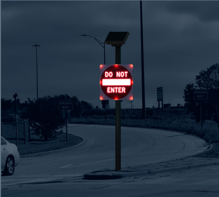
PERPENDICULAR OR OFFSET ANGLES