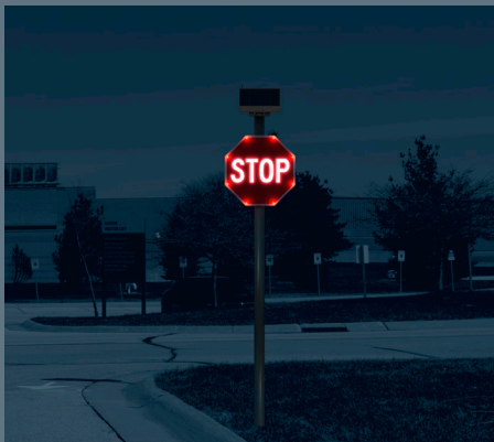
LOW AMBIENT LIGHT CONDITIONS