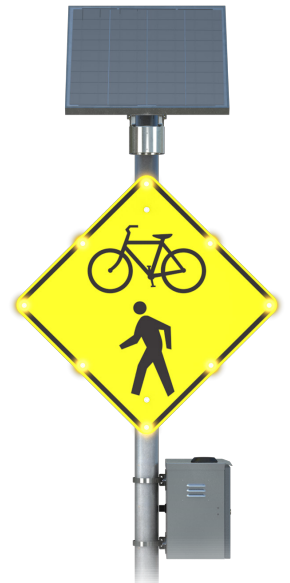
55W SOLAR PANEL, SIDE-OF-POLE CABINET