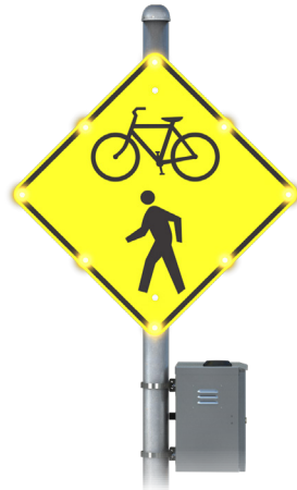
120VAC SIDE-OF-POLE CABINET