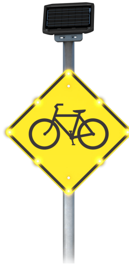
13W SELF-CONTAINED TOP-OF-POLE SOLAR CABINET