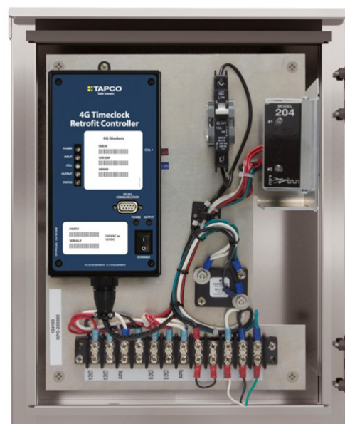
TAPCO Web-Enabled Time Clock