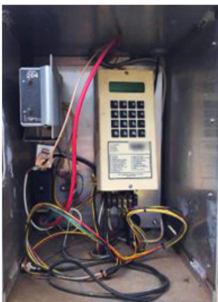
Outdated Time Clock System