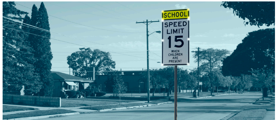
TAPCO Systems Shown.