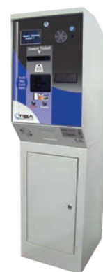
SW-30 Exit Station