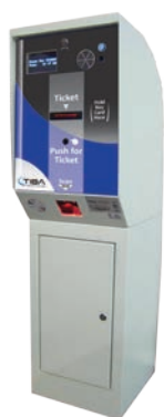
MP-30 Entry Station