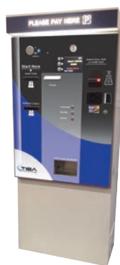
APS-30 Pay Station