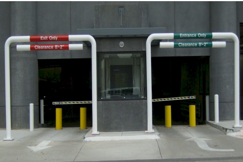
Model B-30 Bollard System

Arranged independently or as a set, the Model B-30 Bollard System incorpo-rates dual speeds. Normal operation, which is site adjustable, and emergency fast operation (less than 1 second) for when immediate deterrence is required. The bollards also feature multiple oper-ating methods including card reader activation, push button control, and vehicle detection to suit the characteris-tics of any operation.