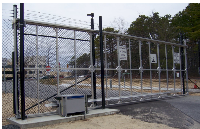
Model LXL-1543-HS High Speed

✓ ✓ ✓ ✓ ✓ ✓ ✓ 4x12 LCD 8 / 3 4 / 4 Option Option Option Option Option